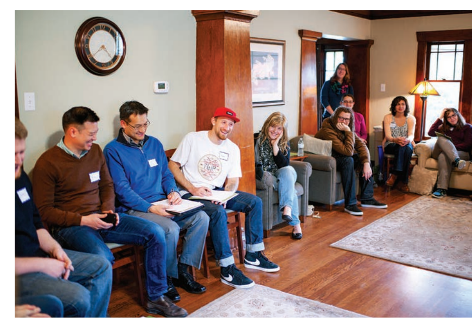
\label{lem:current} \mbox{Current and prospective seminarians gathered at Kingswood House in February.}

Ultimately, some students come to seminary because they sense a clear call. Others come because they sense a stirring in their hearts as they pursue ministry and desire further knowledge and training. Either way, God is mysteriously and graciously at work, leading, guiding, and ministering to those who desire a life of discipleship and ministry.