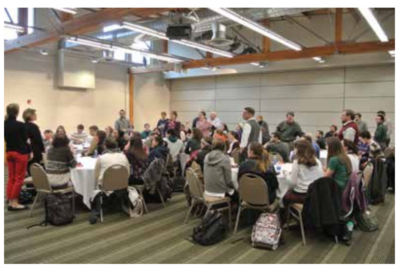
School of Theology faculty and staff stand at the New Majors Lunch.