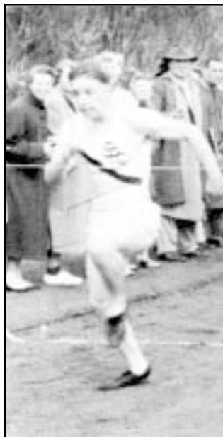
Roy Duncan's school records in the 100 and 200 have stood firm since the Fifties