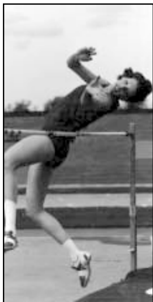
Before making the U.S. Olympic team, Pam Spencer was a three-time All-American in the high jump