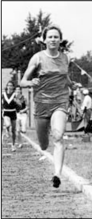
Doris Heritage competed in scores of major international meets, including the 1968 and '72 Olympic Games