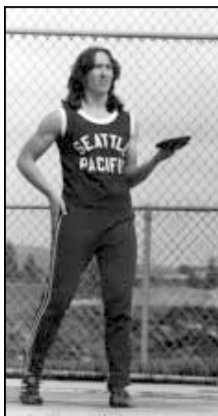
Lorna Griffin threw for the discus record and went on to make the U.S. Olympic Teams in 1980 and 1984