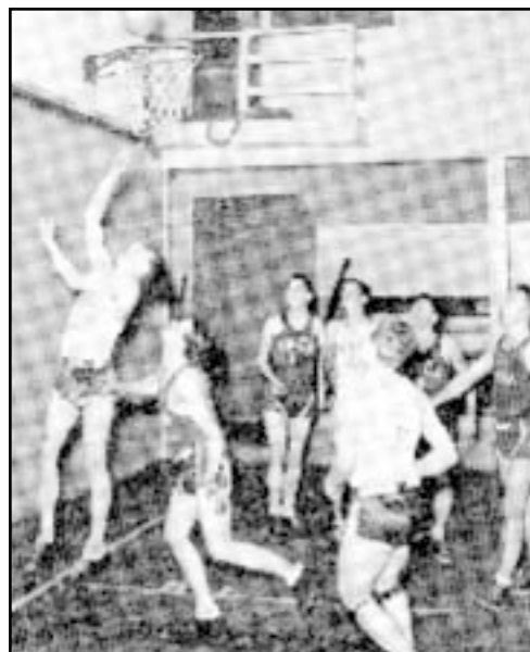
In the formative years, the Seattle Pacific varsity team played primarily Christian universities and local amateur clubs, such as in this 1944-45 game vs. the Seattle YMCA

Seattle Pacific owns the distinction of being affiliated with NCAA Division II longer than any other Northwest school, and the Falcons have made more NCAA tournament appearances (17) than any other Great Northwest Athletic Conference member.