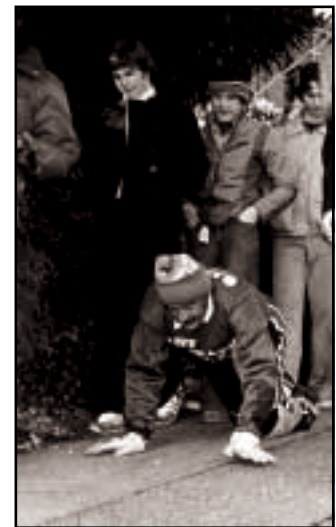
His '78 promise: If they win, I will crawl from SPU to the Space Needle